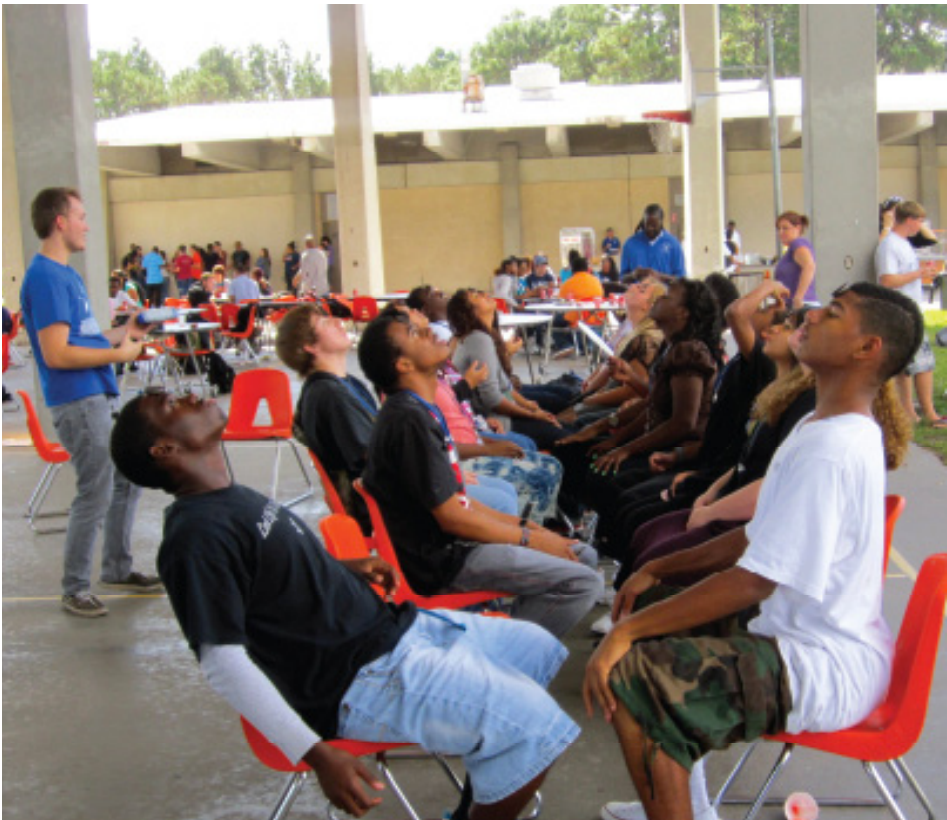
Students participating in the senior picnic.